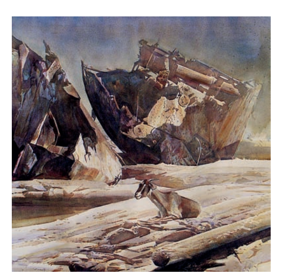
Scapegoat Mkambati, watercolour 86 x 86 cms