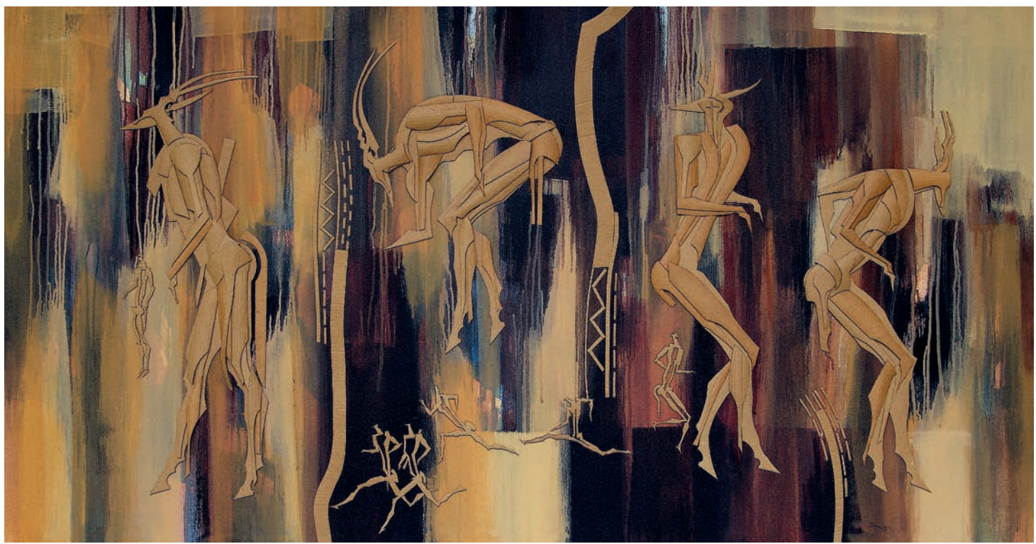
Therianthropes, oil and corrugated board on canvas 100 x 200 cms