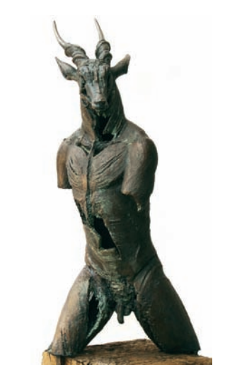
Elandman Therianthrope Sculpure, Bronze 72 x 28 x 30 cms