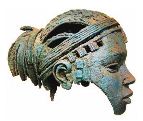
African head, bronze 50 x 40 x 30 cms