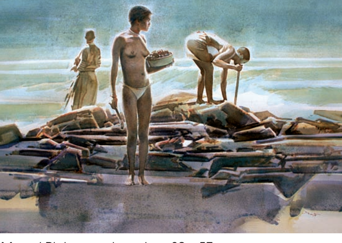
Mussel Pickers, watercolour 80 x 57 cms